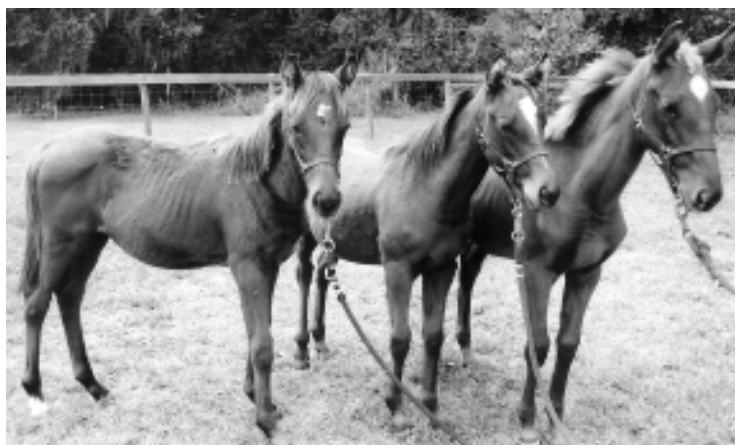
4 month old Marion County Thoroughbred Fillies