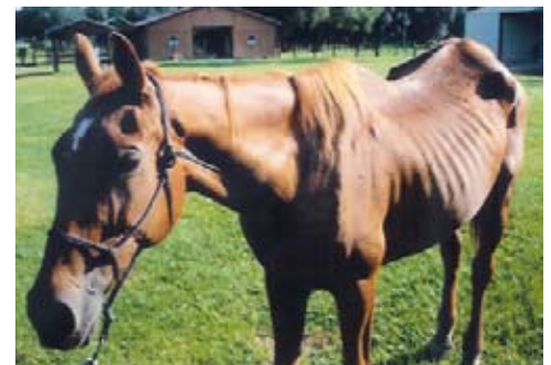
Queen - July 2007