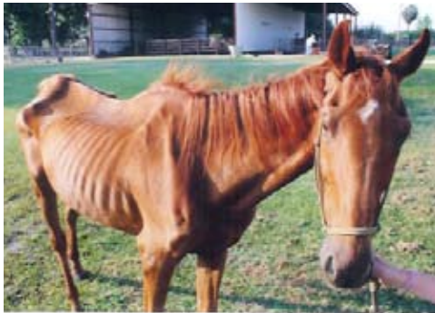
Cali - May 19, 2007