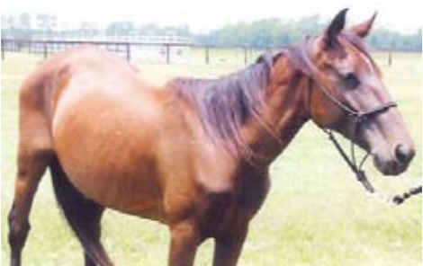
Daisy Mae - July 15, 2007

Please remember to do your holiday shopping online at