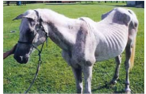
Dusty - June 2007

Just name Horse Protection Association of Florida as your charity and go through iGive.com when you shop. Each store donates a portion of your purchase to HPAF and it's free to you!