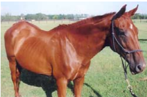
Cali - July 19, 2007