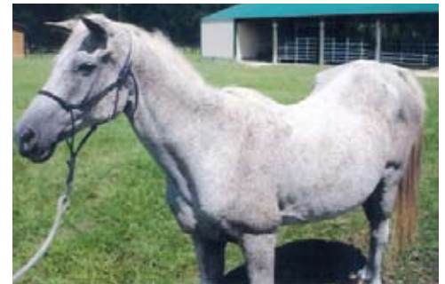
Dusty - September 2007