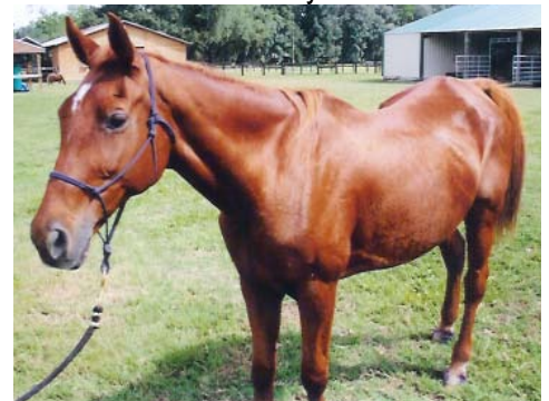
Queen - September 2007