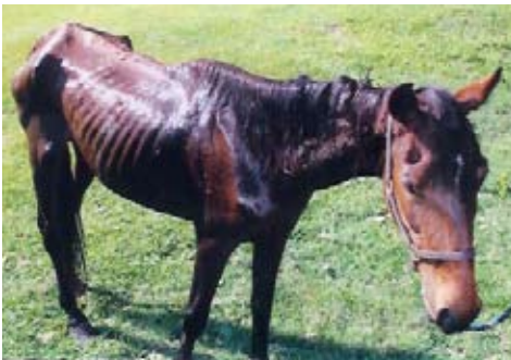
Daisy Mae - June 15, 2007